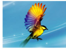
5ms Super-fast Response Time