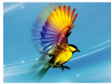
Normal Response Time

5ms super-fast response time, displays motion images without blurring.